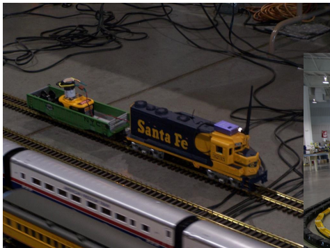
Couple Pics from HAGRS